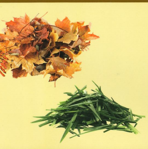
leaves and grass