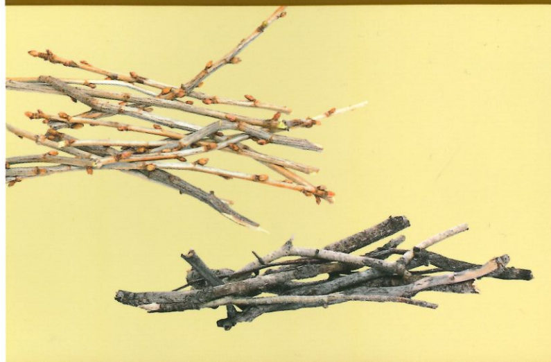
brush and small tree trimmings